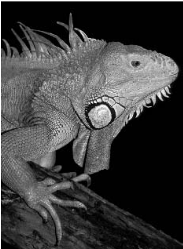
THOMAS WIEWANDT, WILD HORIZONS

A workshop on Green Iguana ( Iguana iguana ) farming included talks on the biology of iguanas, but also addressed enclosures and facilities, nests and incubation, feeding and growth, diseases and their treatment, and legal issues related to farming.