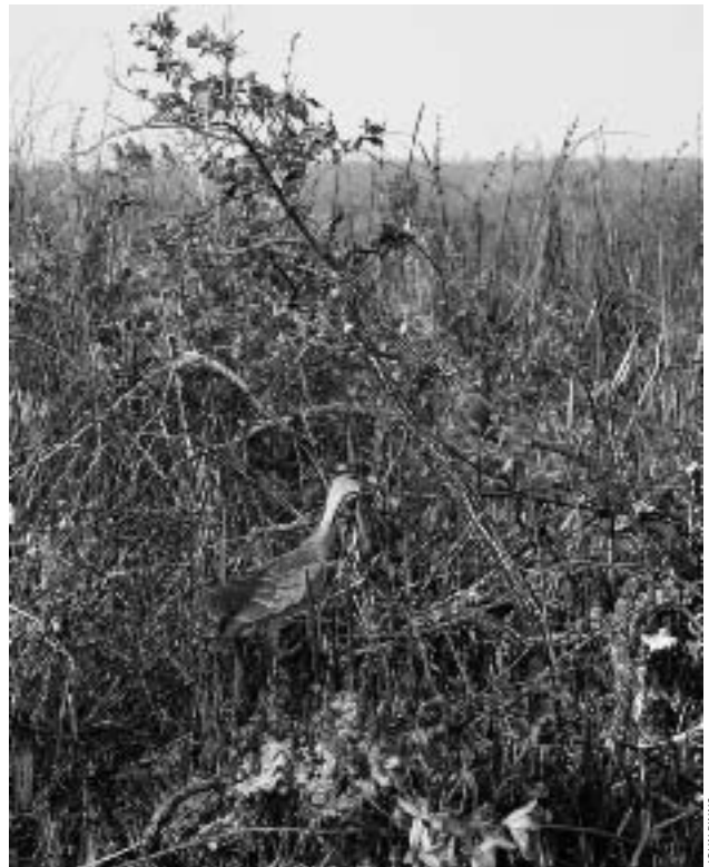
West Indian Whistling Duck ( Dendrocygna arborea ) in the aftermath.