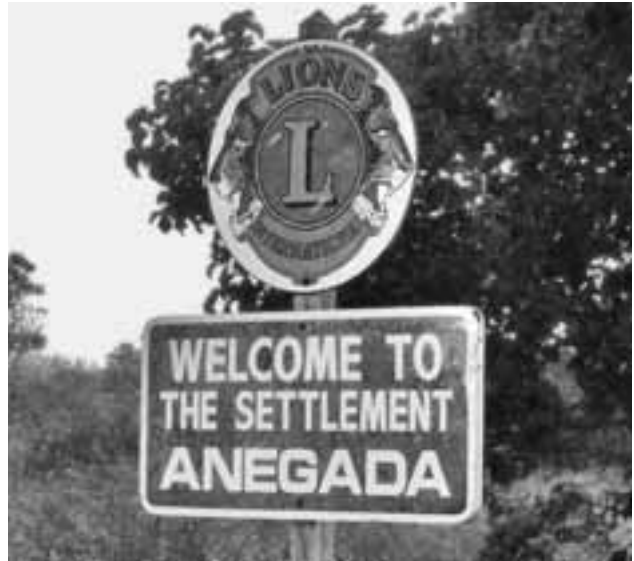
The Settlement is Anegada's main population center. With about 100 full-time residents on the entire island, Anegada offers unique opportunities for outreach.

The Anegada Iguana recovery program demonstrates how conservation and research can be combined into engaging outreach programs. One research project, such as the genetic analysis, can serve as content for numerous educational activities and materials that help engender support for conservation locally, and patently connect others to conservation globally. Clearly, outreach adds value to conservation science and plays an important role in the recovery of the Anegada Iguana.