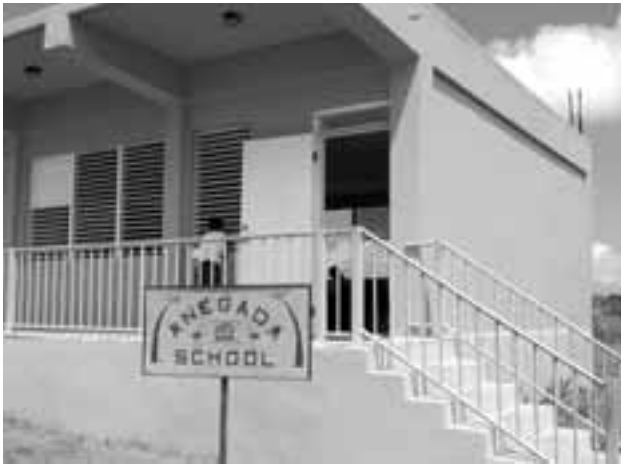
The only school on Aneгада has approximately 40 students and seven teachers.