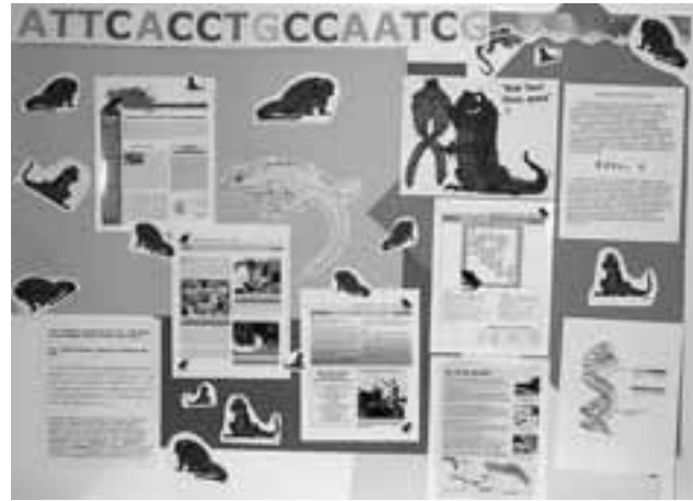
ZooCorps members made this display and used it to help explain the Anegada Iguana’s genetic status to guests.

At the San Diego Zoo, a group of 13–16 year-old volunteers called ZooCorps taught guests about the role genetic research plays in the restoration of the Anegada Iguana. Volunteers were taught about microsatellites and how these non-coding genes are used to give an estimate of genetic diversity within the population. ZooCorps members then set up a booth in front of the Anegada Iguana exhibit for two weekend days and taught guests about what is being done to protect the species. To reinforce the concept of genetics, ZooCorps members led guests in making necklaces out of four differently colored beads representing the four genetic base pairs. At the end of this program, ZooCorps members made necklaces for the