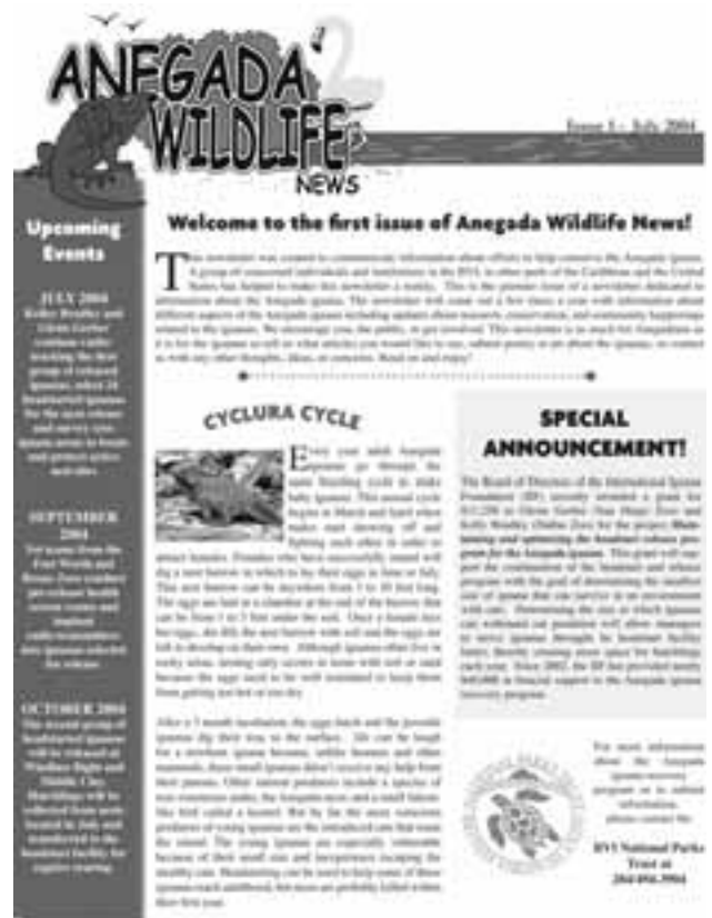
The first issue of the “Anegada Wildlife News” was distributed in Fall 2004. The newsletter serves the important purpose of keeping residents informed about the recovery process.