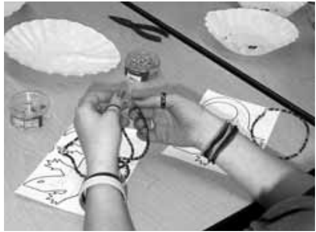
A ZooCorps member makes sure she has the genetic sequence correct for her necklace.

years, a variety of outreach activities that support Aneгада Iguana conservation have been implemented on Aneгада and in the United States. These activities not only add value to the research, but also are ultimately vital to garnering public support for the conservation and research programs.