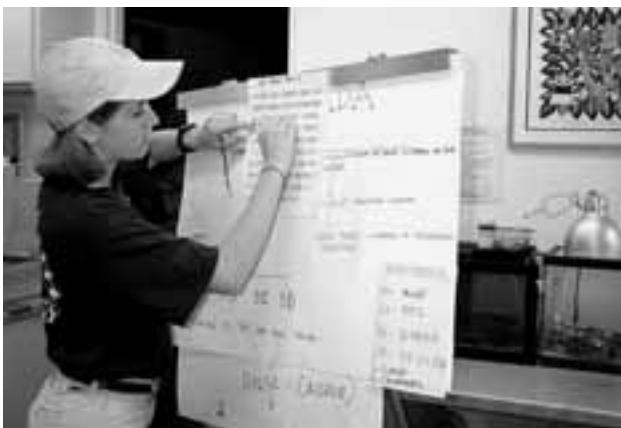
Making a full circle connection; ZooCorps members learned about Aneгада Iguana genetic studies, then made necklaces for students on Aneгада using a sequenced gene from iguanas.

Results of the 2003 survey indicated that the headstart facility is a focal point for locals and tourists wanting to learn more about the Aneгада Iguana. In order to engage this interested audience, we developed plans to create a series of interpretive materials that allow a self-guided experience at the facility. The first sign developed was the result of a genetic study (see below) and will be integrated into other self-guided materials that explain all the activities involved in the recovery of the species.