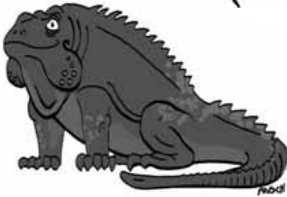
Illustration of a Stout Iguana, Cyclura pinguis .