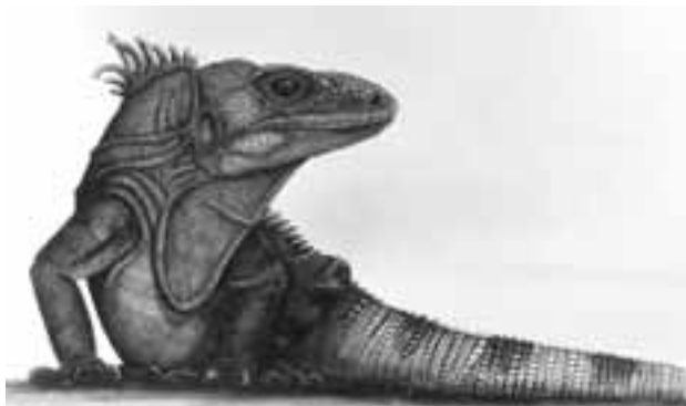
An illustration of an Utila Iguana ( Ctenosaura bakeri ) that Joel created to support the Conservation Program for the Utila Iguana.