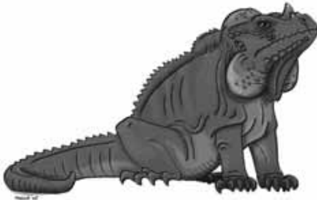
Illustration of a Rhinoceros Iguana, Cyclura cornuta .